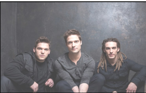
National Recording Artists

Change that Changes Live's has raised $61.50 for Light of Life Community Outreach for the month of July! Thanks NSCC. For August, they will be sponsoring Pressing On Ministry.